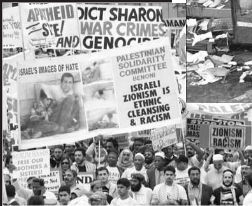
The U.N. Conference Against Racism in Durban promoted racism – against Israel and the Jews.