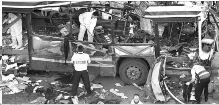
The U.N. has endorsed Palestinian use of "all available means" against Israel.