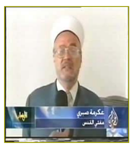
Sheikh Ikrima Sabri

The Publisher: Arab Information Center, Al-Jizah, Egypt. Date of publishing: August 2002 (1 st edition).