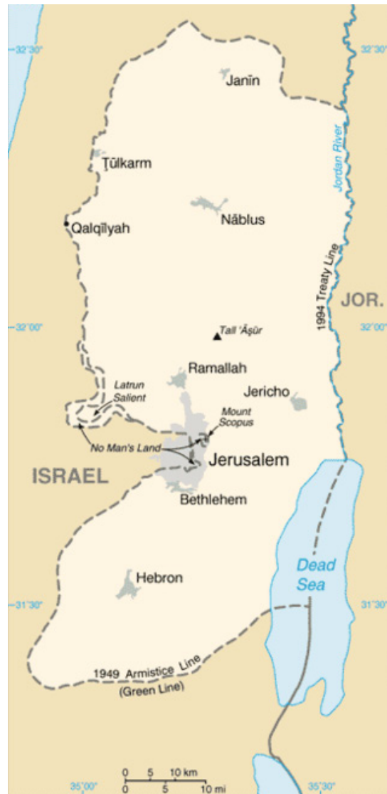
Map of the West Bank